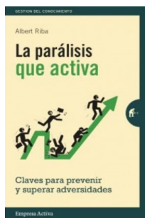
Parálisis Que Activa