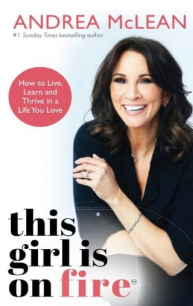
This Girl Is on Fire: How to Live, Learn and Thrive in a Life You Love