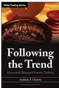
Following the Trend: Diversified Managed Futures Trading