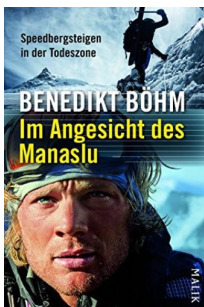
In the Face of Manaslu