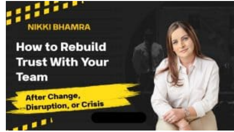
How to Rebuild Trust With Your Team