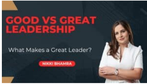
Good vs. Great Leadership