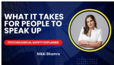
What it Takes for People to Speak Up