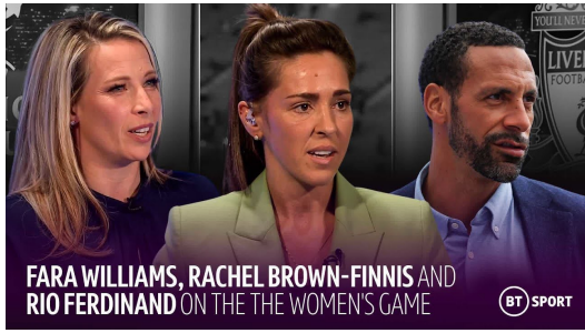
FARA WILLIAMS, RACHEL BROWN-FINNIS AND RIO FERDINAND ON THE THE WOMEN'S GAME