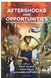
Aftershocks And Opportunities: Scenarios for a Post-Pandemic Future